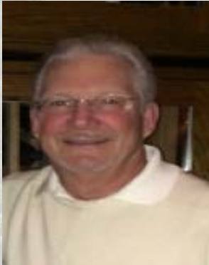
MEMBERSHIP BY Bob Schoenherr

Note – you can bring your own items (hat, shirt, jacket, etc) to Premier Graphx and they will add the logo to it for a nominal fee.