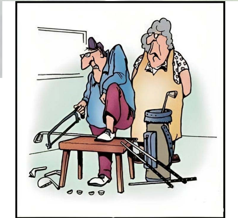
“Did you win?”