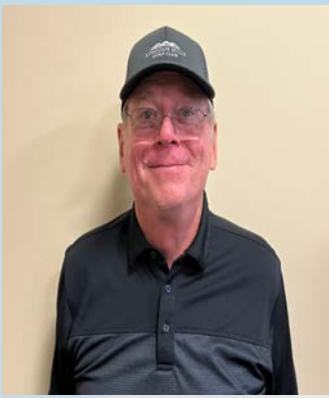
HANDICAP BY Bill Hall

I wanted to congratulate the Most Improved Golfers for the 4th quarter 2023. There are 3 handicap brackets for the Most Improved, index 9.9 and below, 10.0 to 19.9, and 20.0 and above. Here are the names.