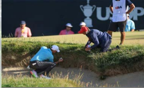
The 18 biggest rules issues of 2023 golfdigest.com

No Thy Rules. They can help or hurt you.